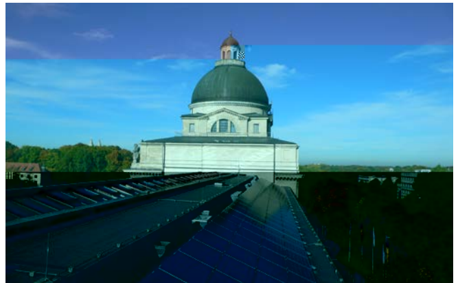
PC05 Trina Solar modules.

Tradition and modernity go hand in hand in Bavaria – and that also goes for the energy system and supply in this economically-strong Southeastern German state. The Bavarian State Chancellery, official residence of Horst Seehofer, Prime Minister of the State of Bavaria, is supplied with solar energy from a PV array. Covering a roof area of 800 square metres, the array generates 70 MWh of solar electricity, which is used by the State Chancellery directly. OneSolar International, a project developer for PV systems and wholesaler for solar products, installed the PV system on the heritage-protected building, using, 296 TSM-